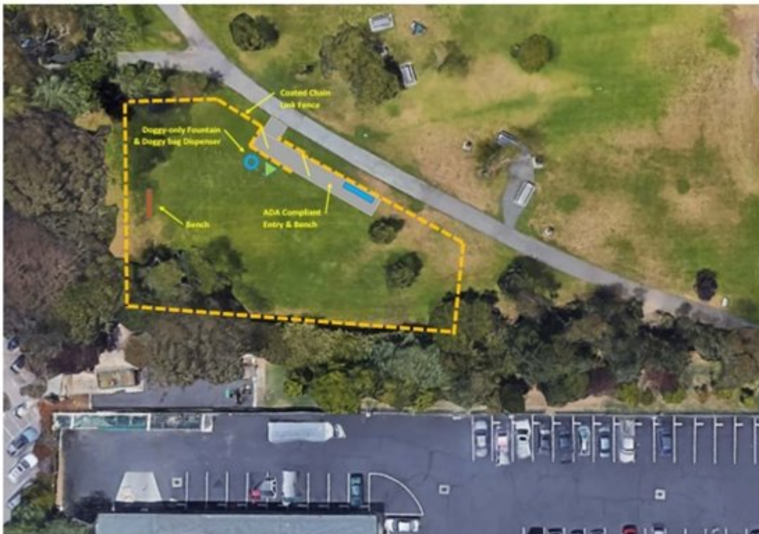
Proposed Site Plan