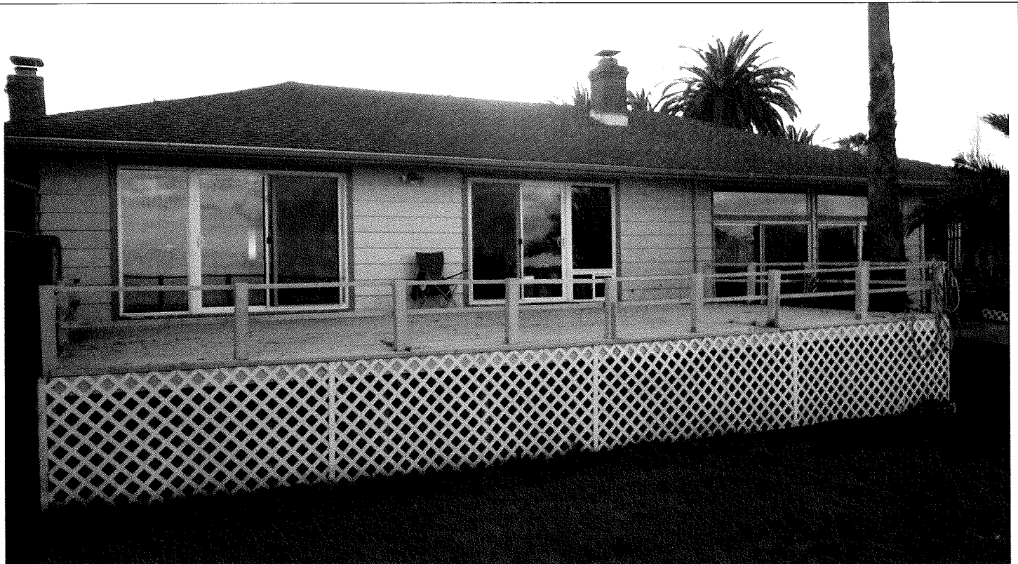
FACING NORTH-WEST 02/28/15 (BACK SIDE OF BLD)

If submitting more photographs than will fit on the preceding page, affix the additional photographs below. Identify all photographs with: date taken; "Front View" and "Rear View"; and, if required, "Right Side View" and "Left Side View." When applicable, photographs must show the foundation with representative examples of the flood openings or vents, as indicated in Section A8.