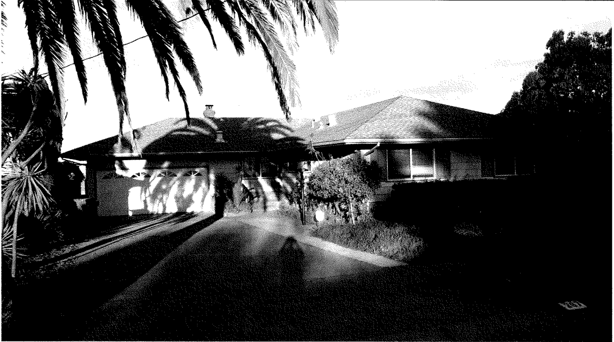
FACING SOUTH-EAST 02/28/15

If using the Elevation Certificate to obtain NFIP flood insurance, affix at least 2 building photographs below according to the instructions for Item A6. Identify all photographs with date taken; "Front View" and "Rear View"; and, if required, "Right Side View" and "Left Side View." When applicable, photographs must show the foundation with representative examples of the flood openings or vents, as indicated in Section A8. If submitting more photographs than will fit on this page, use the Continuation Page.