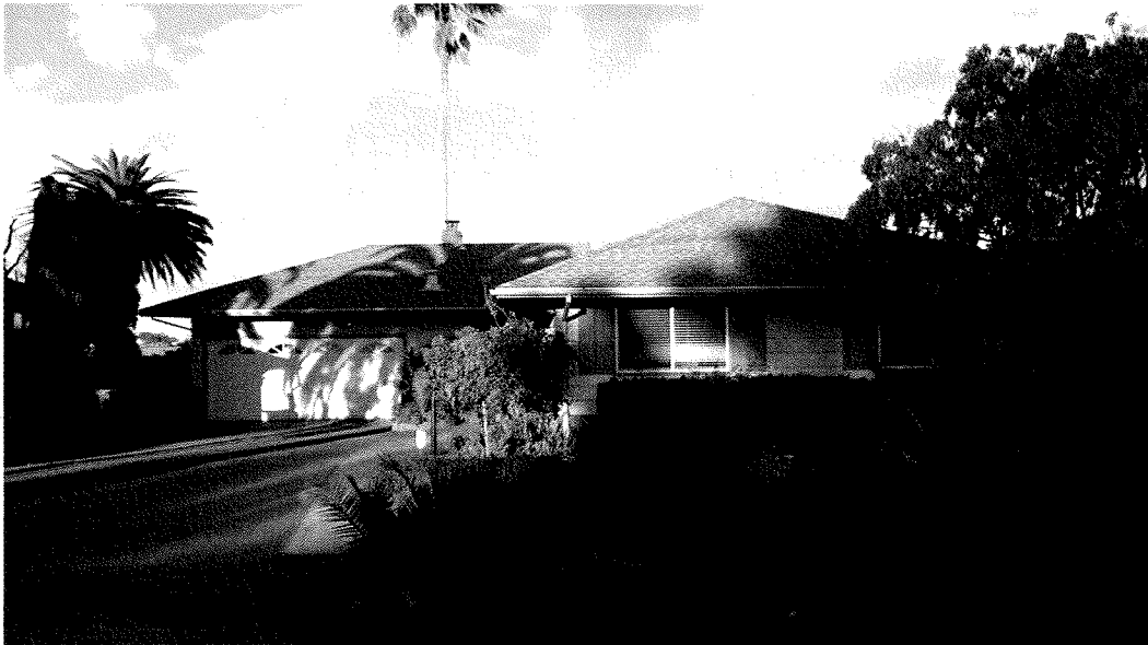
FACING EAST 02/28/15