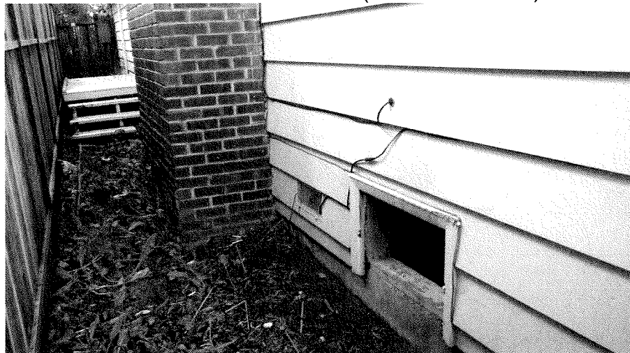
CRAWL SPACE ON SOUTH SIDE OF BLD 02/28/15