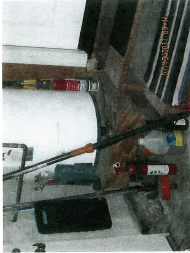
Raised Water Heater Located in Garage