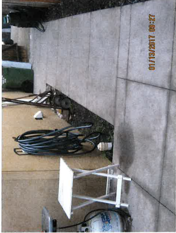
Southerly Side of House

If submitting more photographs than will fit on the preceding page, affix the additional photographs below. Identify all photographs with: date taken; "Front View" and "Rear View" and, if required, "Right Side View" and "Left Side View." When applicable, photographs must show the foundation with representative examples of the flood openings or vents, as indicated in Section A8.