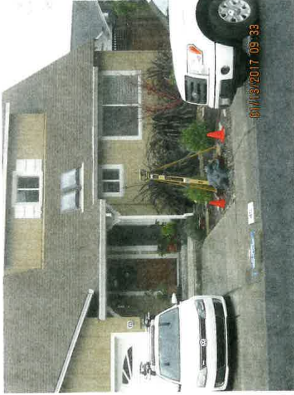
Front of House Looking West

If using the Elevation Certificate to obtain NFIP flood insurance, affix at least 2 building photographs below according to the instructions for Item A6. Identify all photographs with date taken; "Front view" and Rear view"; and, if required, "Right Side View" and "Left Side View." When applicable, photographs must show the foundation with representative examples of the flood openings or vents, as indicated in Section A8. If submitting more photographs than will fit on this page, use the Continuation Page.