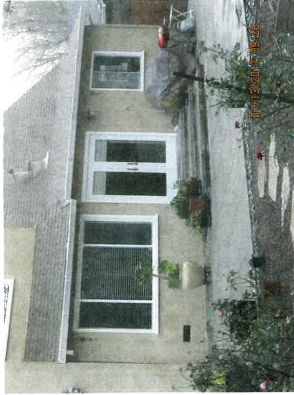
Back of House Looking East